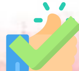
Give Thumbs Up