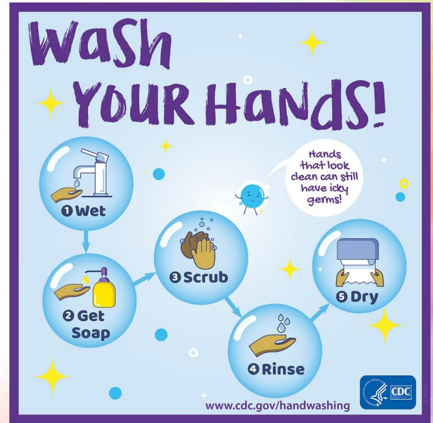
Washing our hands regularly.