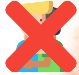
Hugging our friends