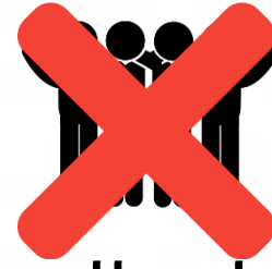
Being really close to other people