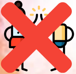
Giving high fives