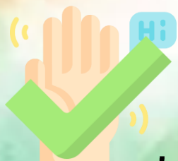
Wave to each other