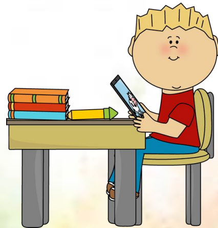
Working at your own desk