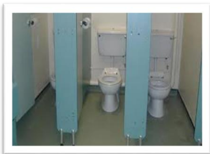
Independent toileting and hand washing

We try to encourage all children to be as independent and responsible for themselves as possible.