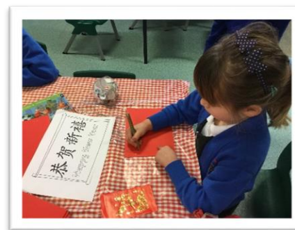
The correct pencil grip