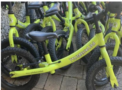
Scootering and Balance Biking