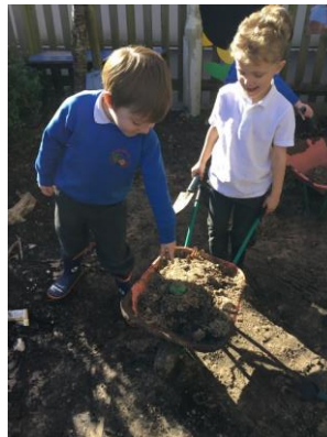
Sweeping and Digging