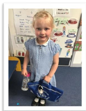
Carrying their own belongings