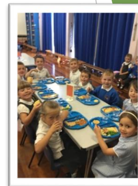
Using a knife and fork