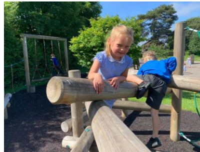
Trim trails and climbing at the parks